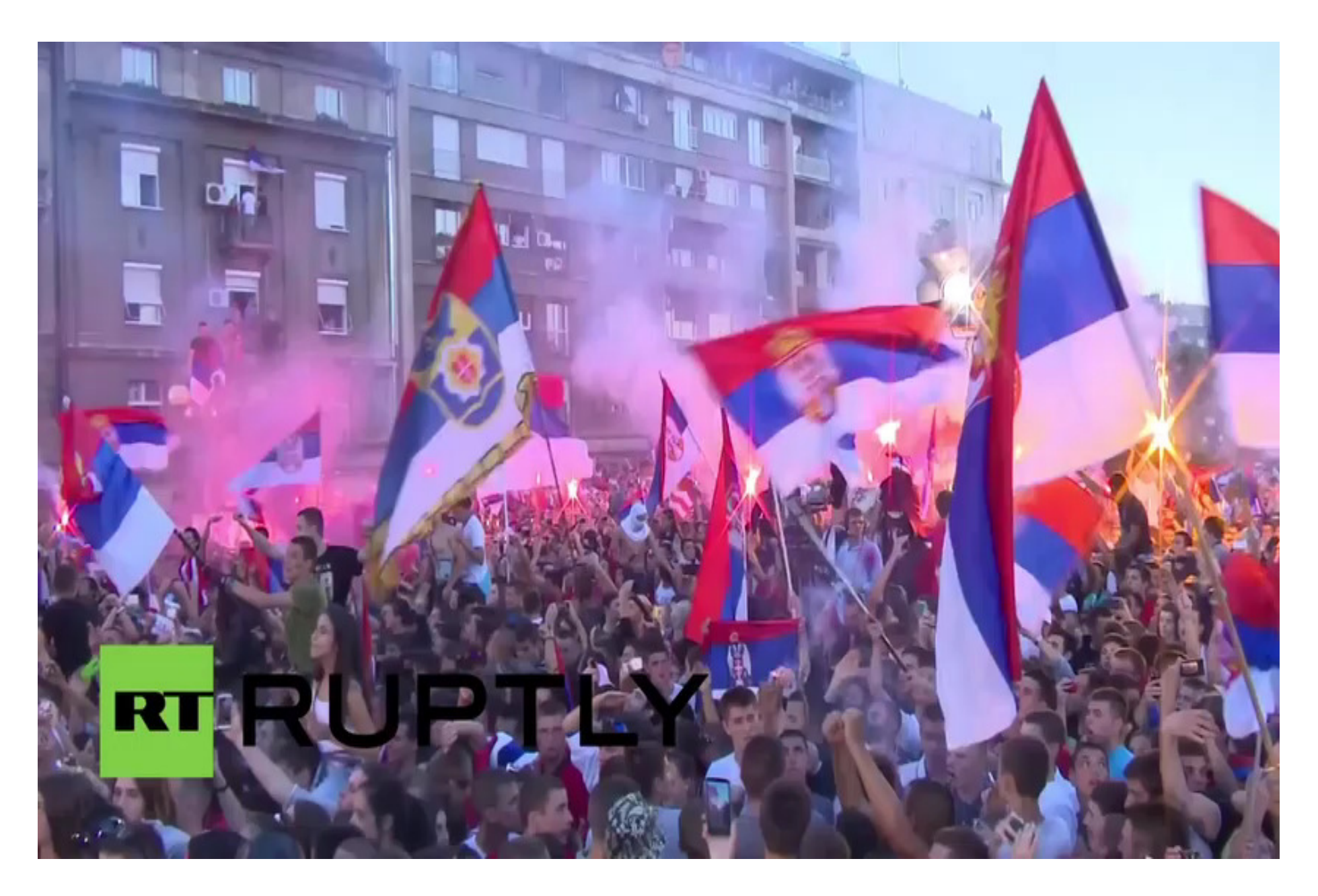
U-20 Serbia Team celebration in Belgrade