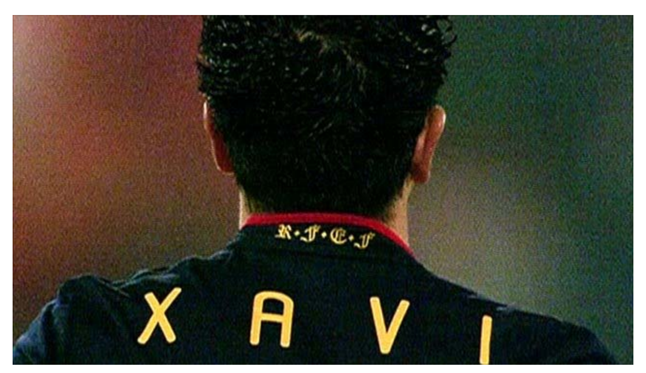
Ballon d'Or trio light up World Cup