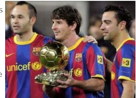
Barca's three Fifa Ballon d'Or finalists

"But he did adapt very well in the end, and he's really humble considering all that he's achieved. Here we teach discipline, order, control, and we try to show that a football player can be a star without being a 'show-off', just by making your teammates better."