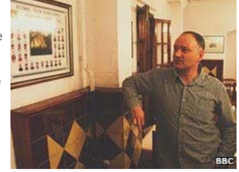
Folguera has seen many current stars

"Up to the age of 16 we don't do any fitness training with the boys, just practice with the ball. Then we add the fitness training, but always incorporated into exercises with the ball." blossom at La Masia